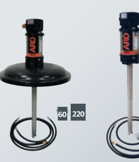
DCX Package The ARO line of lubrication pumps can be configured with a drum cover and air controls for the transfer and supply of oil and grease.