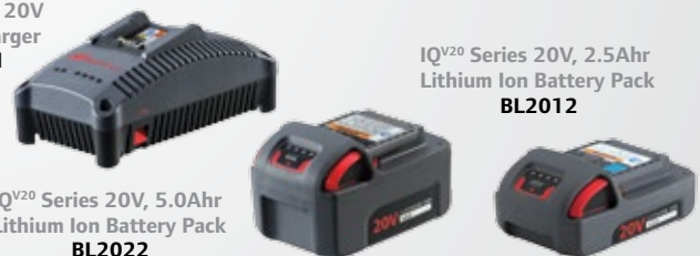
IQV20 Series 20V, 5.0Ah Lithium Ion Battery Pack BL2022