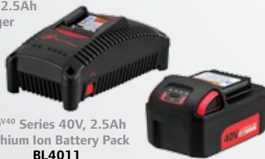
IQV40 Series 40V, 2.5Ah Lithium Ion Battery Pack BL4011