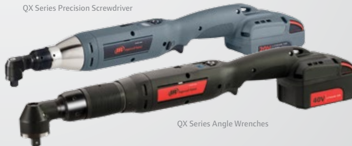
QX Series Angle Wrenches