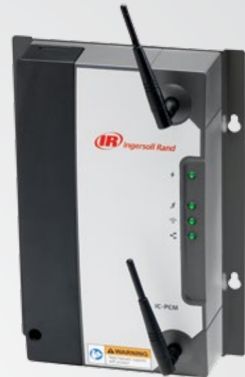
Process Communication Module IC-PCM-2-US