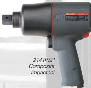
2141PSP Composite Impacttool