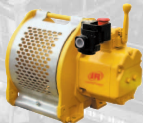
LS gear motor winch