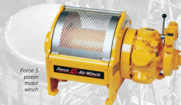
Force 5 piston motor winch