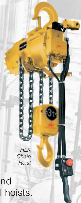
HLK Chain Hoist