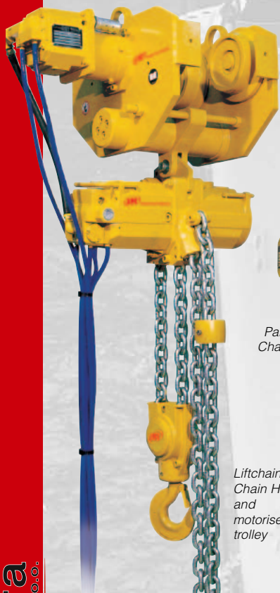
Palair Plus Chain Hoist