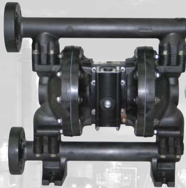
Carbon Fiber Series Pump