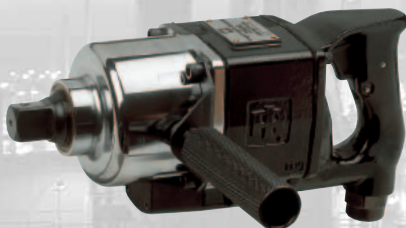
2934B2SP-EU Alloy Impacttool